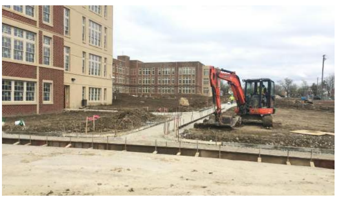
Forming Sidewalks Area G Courtyard & Area A South