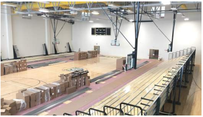
Bleacher Installation in Area C Competition Gym