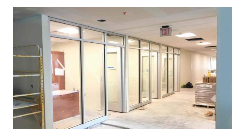
Curtain Wall Installation on Area A Cedar Level