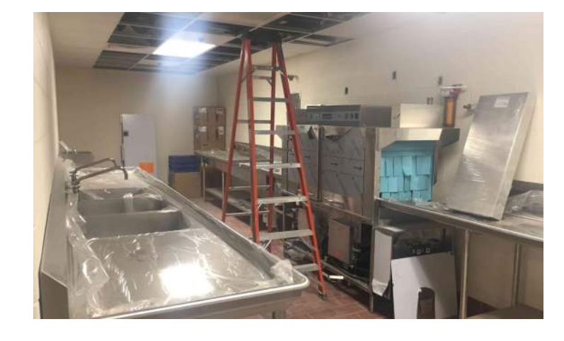
Kitchen Equipment Installation in Area E Cedar Level