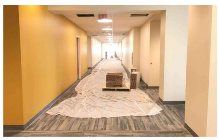
Finishes in Area A 3rd Floor Corridors