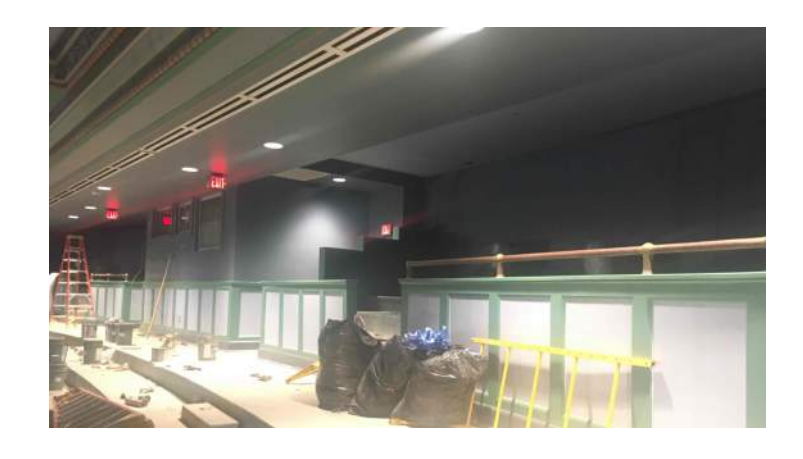
Painting on Area G 2nd Floor Auditorium Balcony